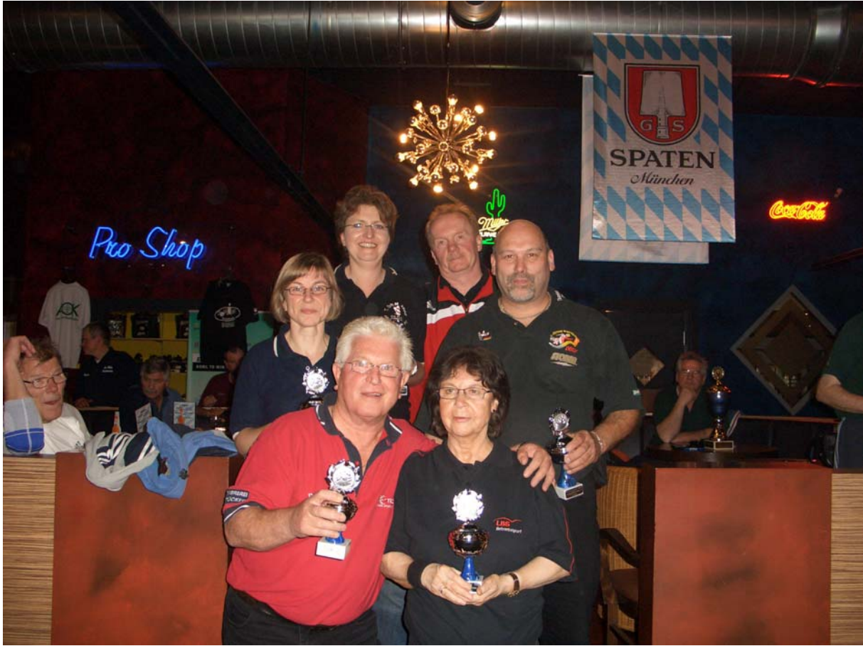
Sieger und Platzierte